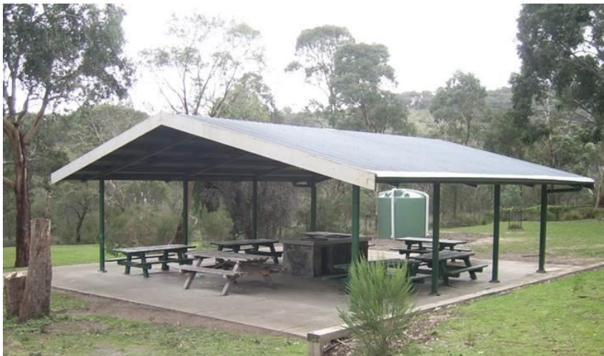
Meet at the Churchill National Park BBQ Area

For more information and to register for the event please send an email to event@sarcnet.org indicating how many adults and children will be attending each day.