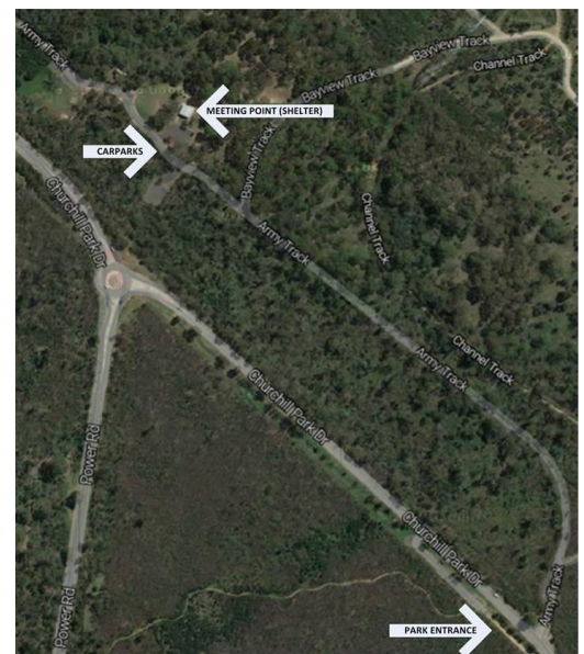
Churchill National Park Location and Entrance is show on Melway map 82 - C11. Note: Please take all rubbish home. Firearms and pets are not permitted. Native plants and animals are protected. See: http://parkweb.vic.gov.au/explore/parks/churchill-national-park